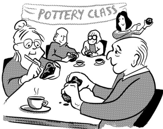
SOCIAL READJUSTMENT RATING SCALE